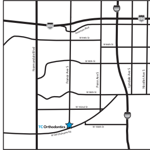
Bloomington 10617 France Avenue S. • Bloomington, MN 55431 (952) 884-9161