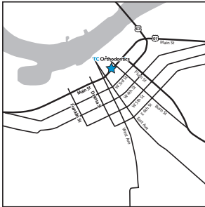
Red Wing 433 Main Street • Red Wing, MN 55066 (651) 388-8851